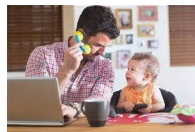
Click picture for some funny clips with dad. We all can use a good laugh.